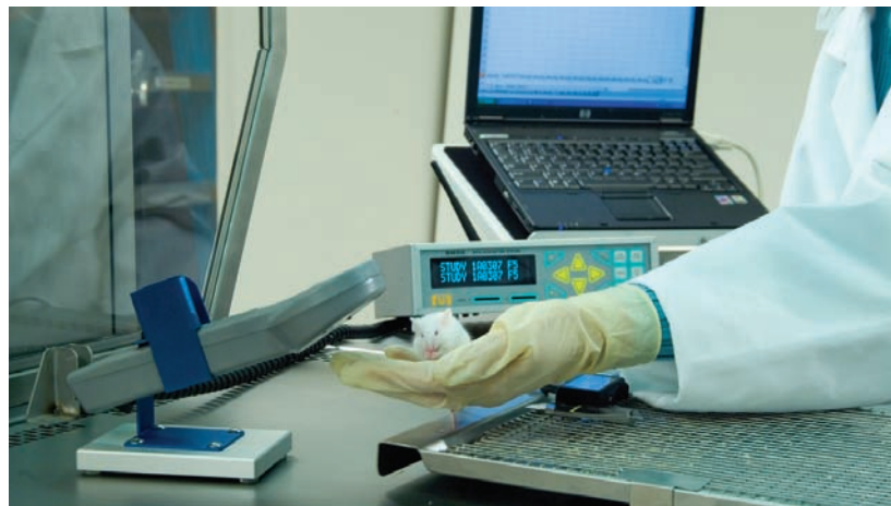
Broad reading field makes scanning easy